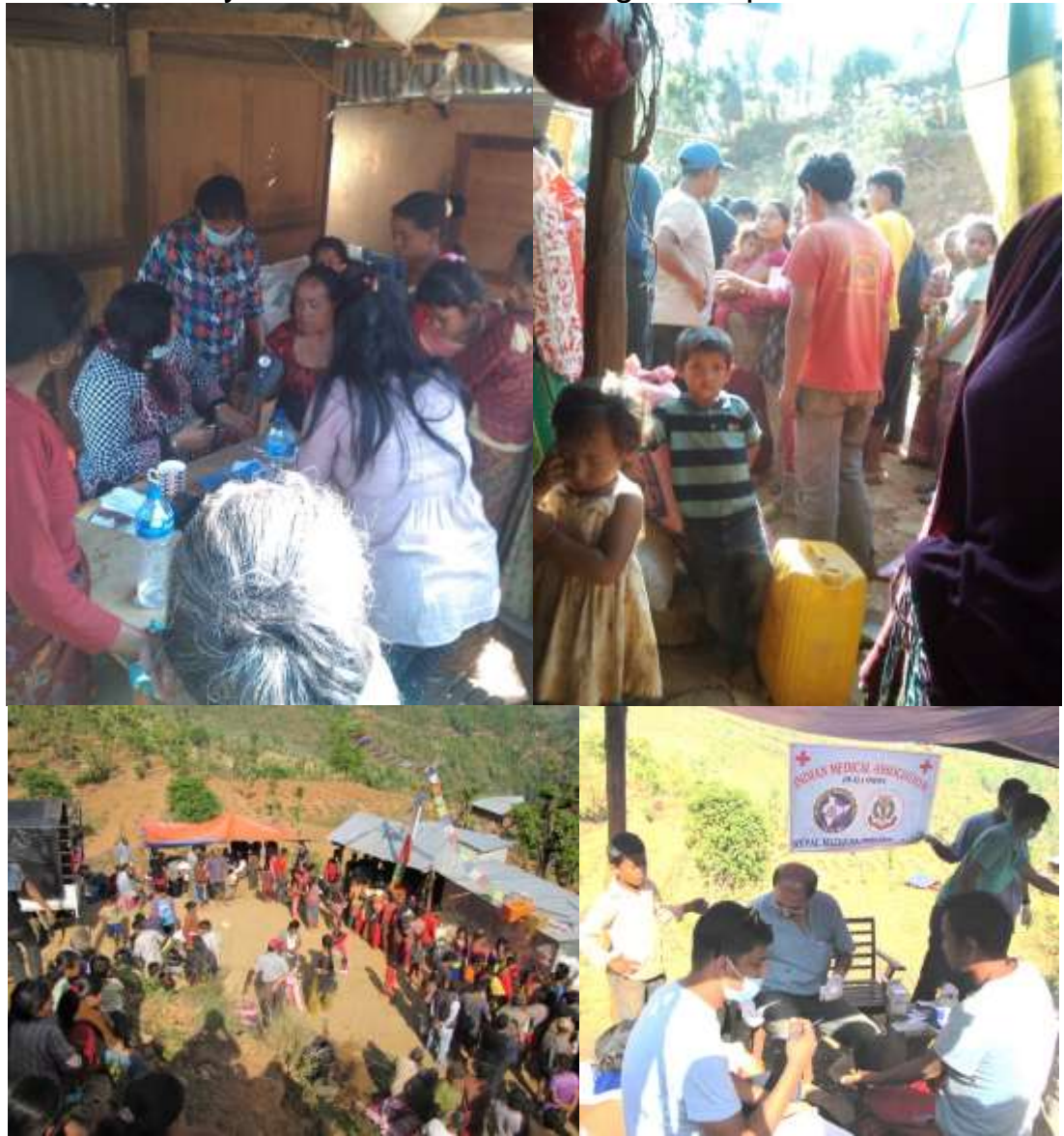
Remote Session around 120 Kms from Kathmandu Examined over 725 patients, mostly elders and children