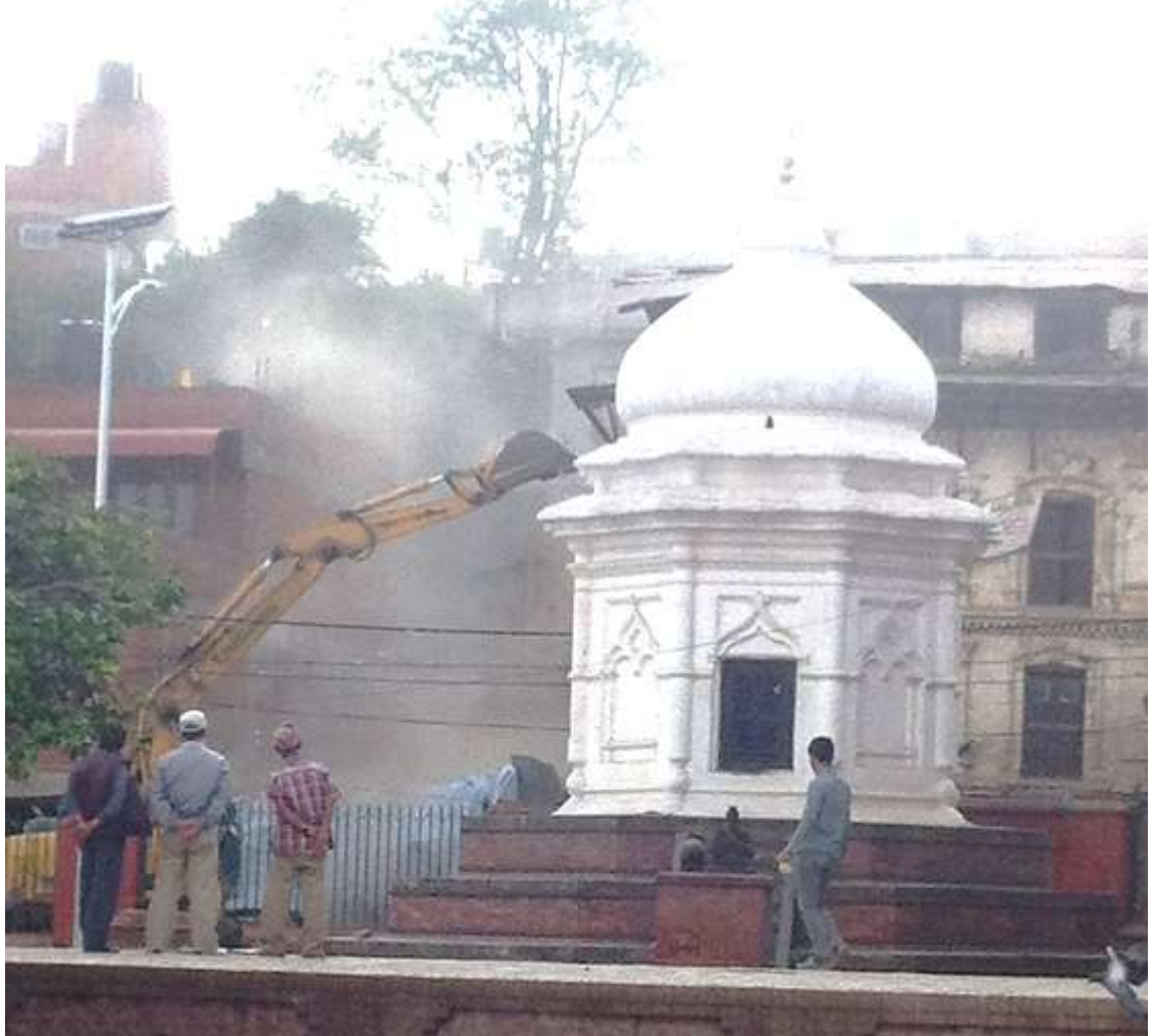
On the Street and several spots in the City of Kathmandu